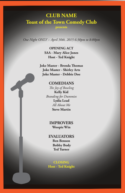
Sample Agenda (5 1/2 x 8 1/2 inch)

Another version - have 2 teams of 3 people compete and vote for the team with the best story. No time limits are given but speakers are encouraged to move quickly and not to over think answers.